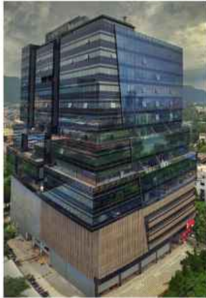
Centrum Business Park