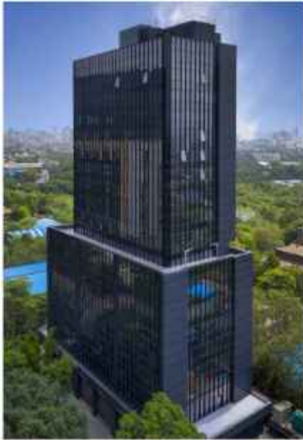
Oriana Business Park