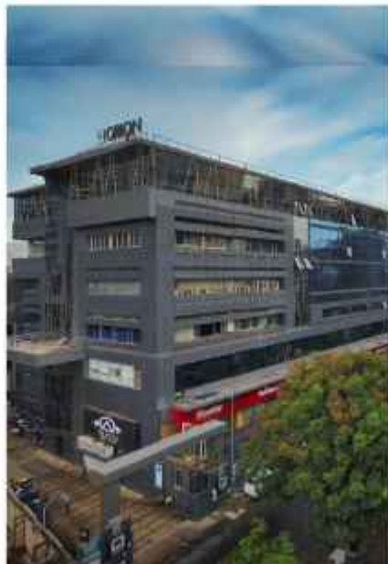
Orion Business Park