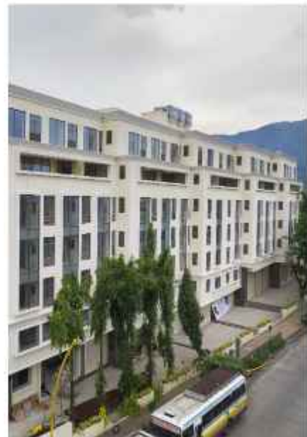
Omega Business Park